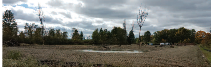
SW corner of Lowe Plank & 29 Mile Rd., wetland mitigation

from former farm fields and placing 190-acres of woodland, wetland and riparian buffer into a conservation easement. This was done to create an inland wetland for migratory birds in exchange for the removal of the wooded acreage, and as approved by the Environmental Protection Agency (EPA) and Michigan Department of Environmental Quality (MDEQ).