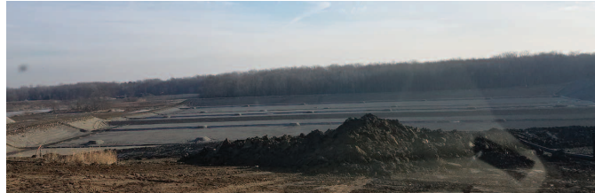
Pine Tree Acres looking east at new cells and forested wetland

Early in January 2019, WM completed the removal of additional wooded acreage to the east of cells 24 & 25 for future cells 26, 27 and 30. As well, this summer, the Lowe Plank and 29 Mile Rd. wetland mitigation project was completed, creating 41-acres of wetland